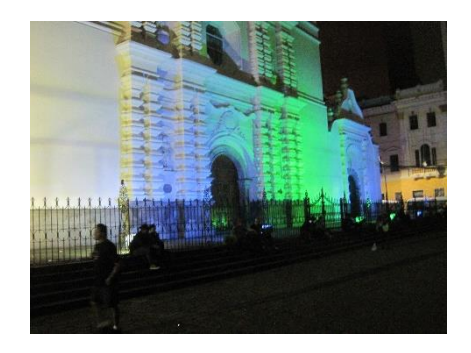
Tegucigalpa Oct. 2018