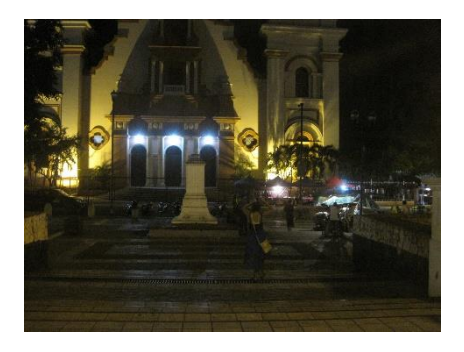
San Pedro Sula Oct. 2018

share this compelling story. What I've written is just a glimpse of all that BECA is achieving. Check out website their (http://www.becaschools.org/abou t/about-us) and consider a generous It is a proactive donation. response to our deeply flawed immigration policy and a rewarding investment in the future of Honduras.