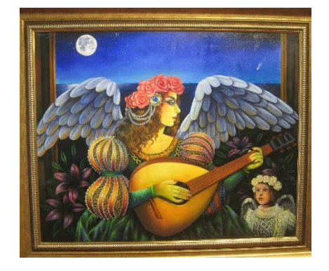
Art Museum Tegu Oct. 2018 Julio Visquevra