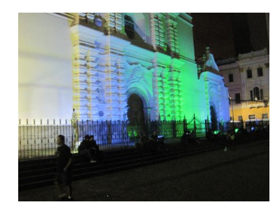
Tegucigalpa Oct. 2018

their website (http://www.becaschools.org/about/about-us) and consider a generous year-end donation. It is a proactive response to our deeply flawed immigration policy and a rewarding investment in the future of Honduras.