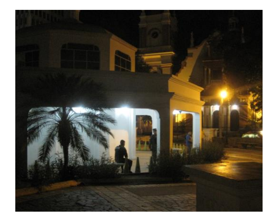
SPS Oct. 2018 with military police